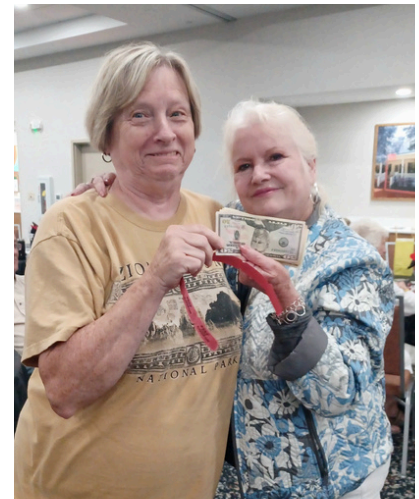
Show me the money!