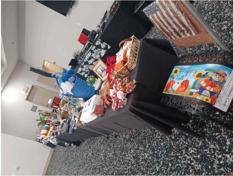
So many auction items! We raised nearly $1,000!