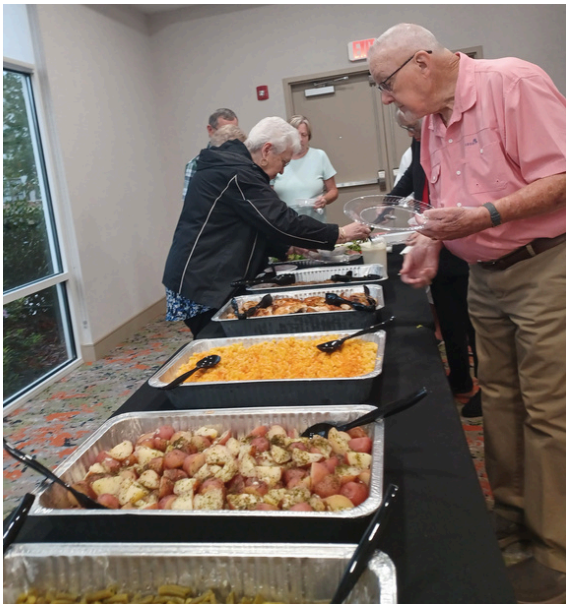
The catered meals were DELICIOUS!