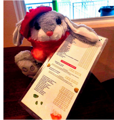
Above: Cocktails in Grand Cayman. Below: Taking a break from hiking the rain forest near Ocho Rios, Jamaica.

Regardless, I've had a great time traveling and sharig my travel adventures with my Pioneer family through this magazine. Stay tuned for more mascot adventures!