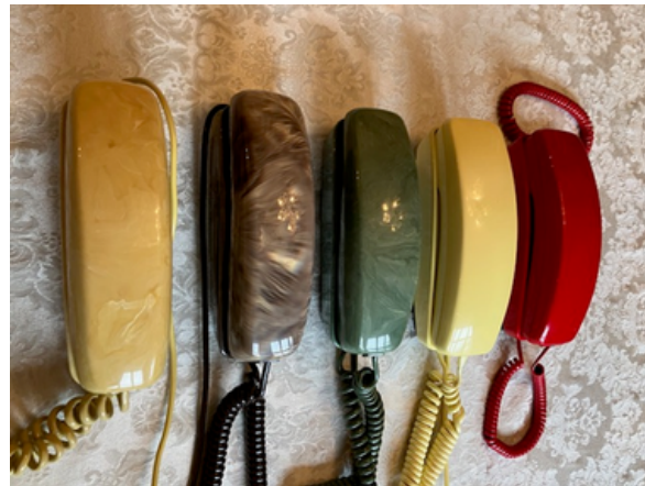
Above, From left to right: Yellow, brown and green swirl S-C Slenderet phones. Yellow and red GTE Styleline phones.

Stromberg Carlson (S-C) made their Trimlines under license from Bell and most of their phones are similar colors to Western Electric, but S-C did make four different "swirl" telephones in Cherry, Yellow, Brown, and Green. If anyone has a Cherry Swirl they would like to sell, let author know. GTE made a Trimline variant called the Styleline with a different style plug connector. Those phones were a little larger than the WE and S-C Trimlines.