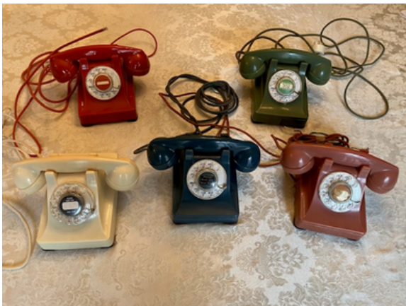
Above: The five colors of the 302, left to right, are: Ivory, Pekin Red, Dark Blue, Gray-Green, and Old Rose

So this story is more about the more modern phones starting with the WE 302 models and going up to the -500 sets with Princess and Trimlines giving us the bulk of colored phones. In fact, if it weren’t for former First Lady Jacqueline Kennedy, there would be no black Princess phones or Trimline phones.