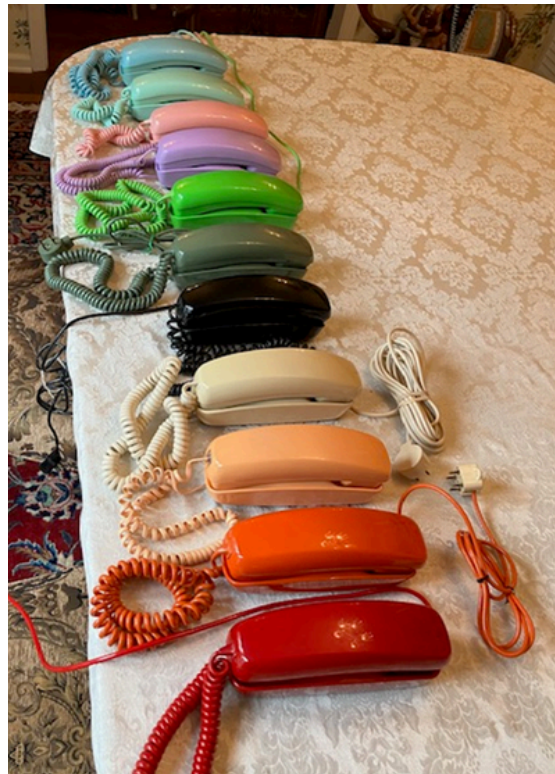
Above: A line up of Trimline-style phones: All are Western Electric except the orange and lime green which are Stromberg Carlson and the cherry red which is ITT in origin. The violet phone was made for Northwestern Bell.